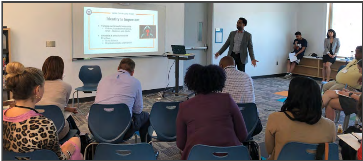
Mr. Chardin closing the visit by discussing the importance of identity and Stories of Self.

100 putnam ave. cambridge, ma 02139 | T: 617.349.7780, F: 617.349.3358 | putnamavenue@cpsd.us